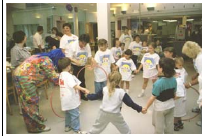
The Games were fun!