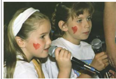
Our singers were great!